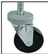
Optional Casters Available