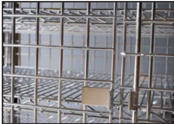
Optional Standard Shelves Available