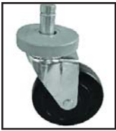
Optional Casters Available