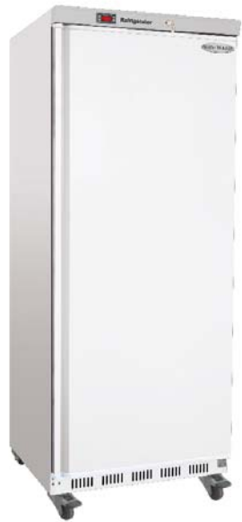
EF-25 Single Freezer